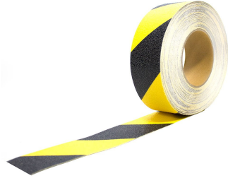
Yellow / Black