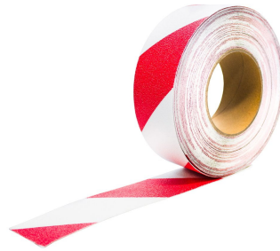
Red / White