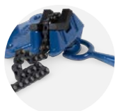
Chain vice CV4