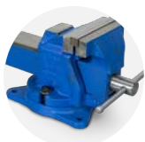
Engineers vice CV6